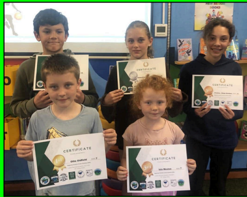
Cluster Cross Country Place getters