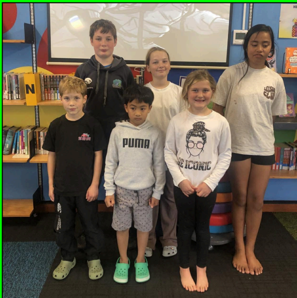
Students displaying WVS Values