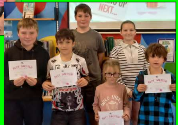
Students awarded for "Best Dressed on Pink Shirt Day"