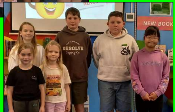
Students awarded for this week's value "Unique"