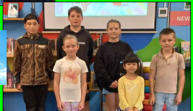
Students awarded for this week's value "Confidence" by our Student Leaders