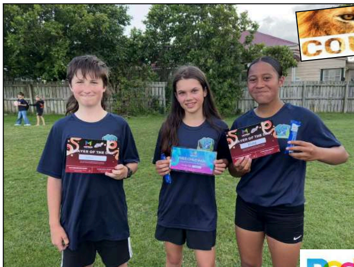
Tuakana Players of the Day