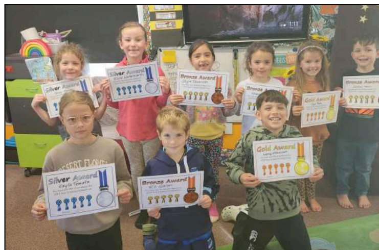
Years 1, 2 & 3