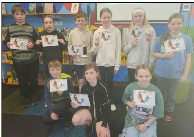
Waikite Valley Intermediate Grade - Searancke Fairplay Trophy