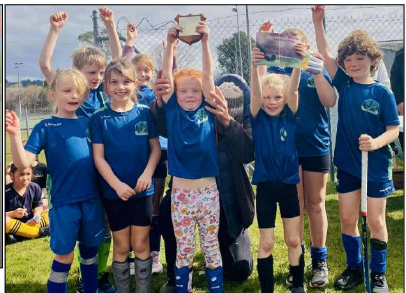
Waikite Valley Minis - R.J.H. Minis Achievement Award