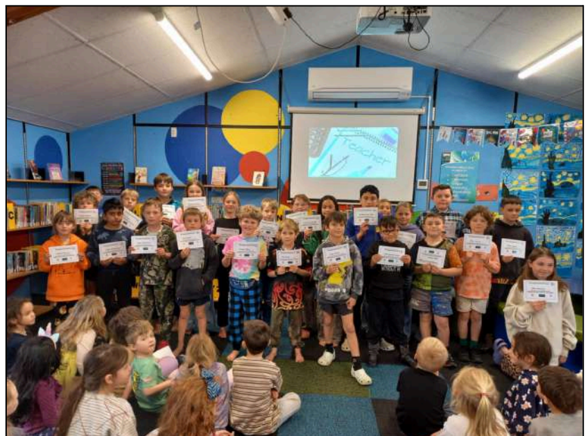
C.B.O.P. Winter Sports Contestants