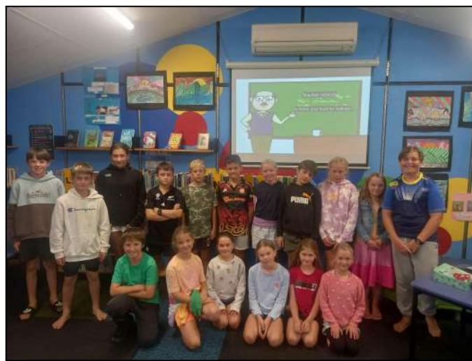
2024 Waikite Valley School R.V.C Swimming Sports representatives