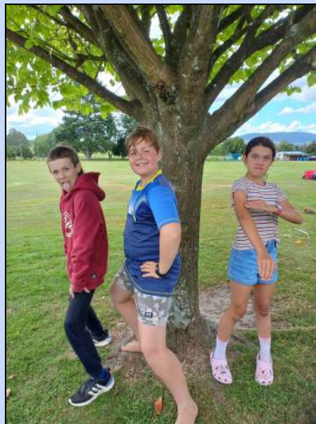
Kapa haka Leaders