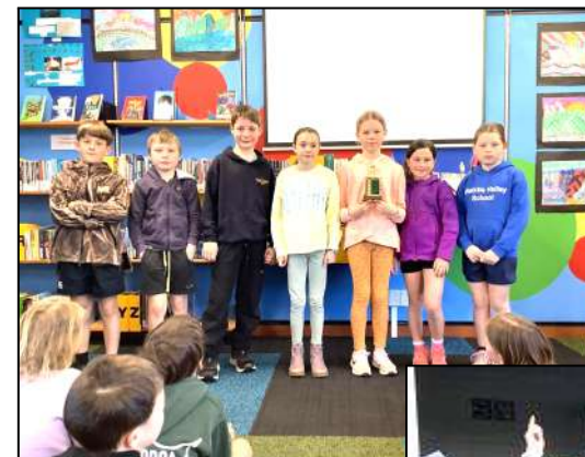
Waikite Valley Ducks B Grade Runner up Maxi Team