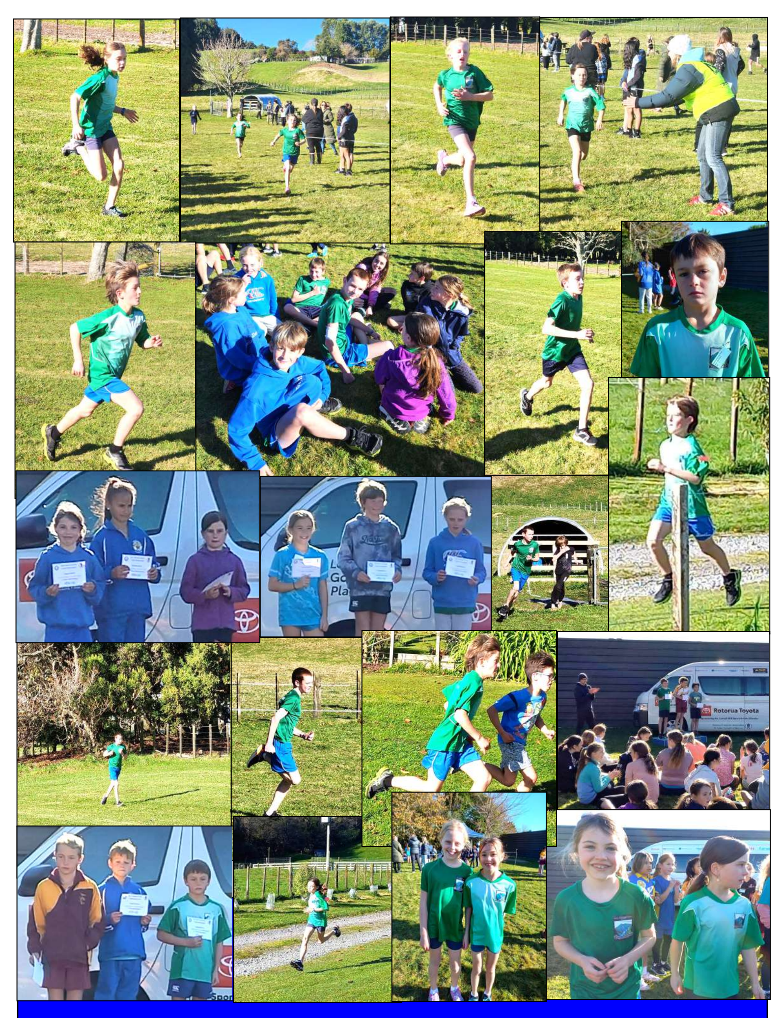
Rural Cluster Cross Country 2023