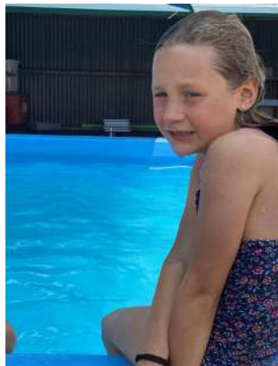
Monet - I like being underwater