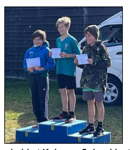
15 Waikite Valley School students ran at the Rural Cluster Cross Country held at Kaharoa School last Tuesday with some fantastic results. Those who qualified (9 students) will represent our school at the Bay of Plenty Inter-School Cross Country tomorrow (Tuesday 28 June) at Kaharoa.