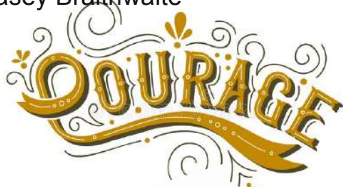
Rm 4 - Dakota France & Ryder Trumper