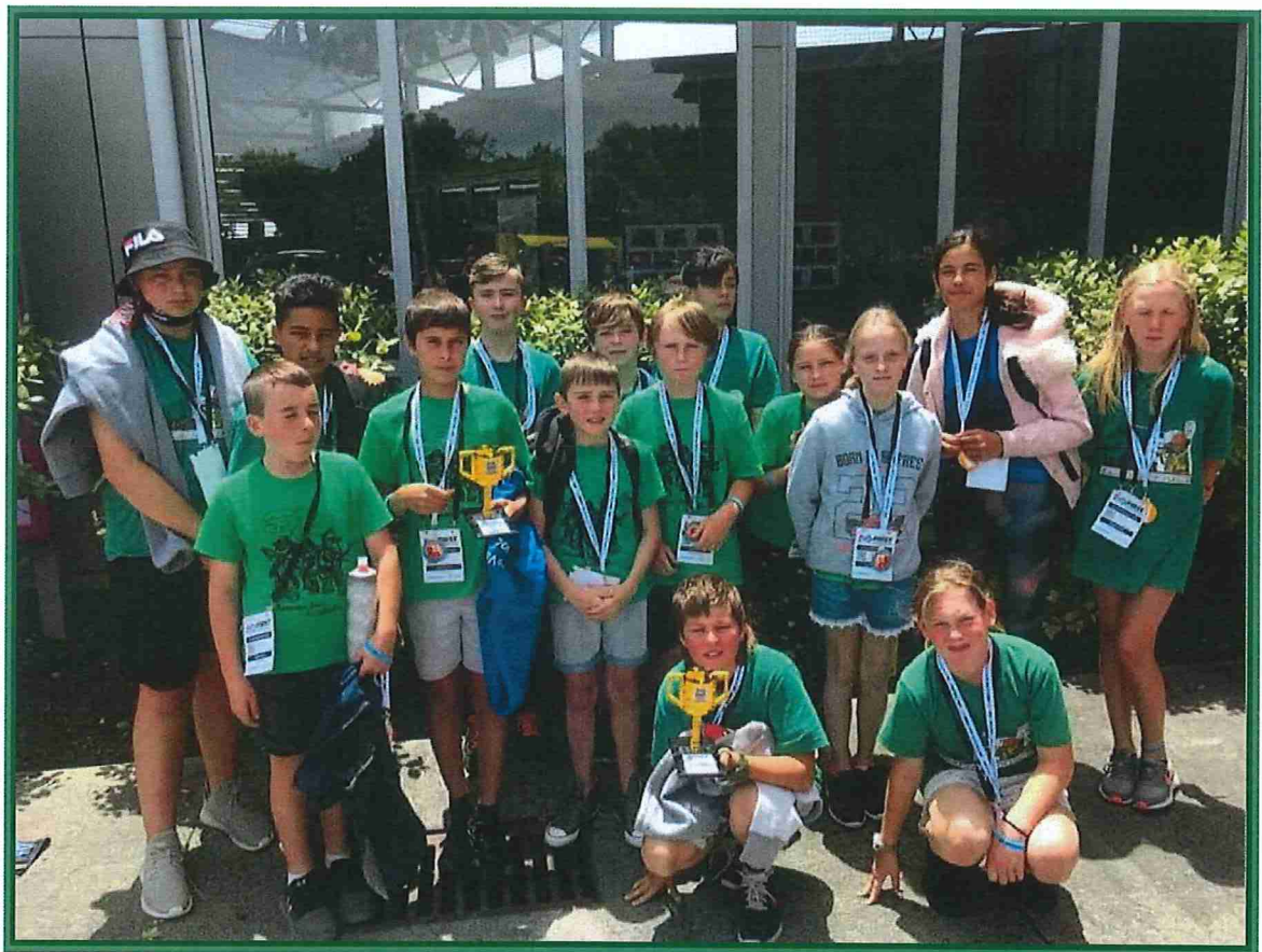
FIRST LEGO LEAGUE TOURNAMENT, DECEMBER 2020