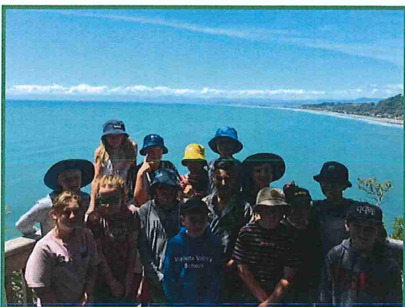
OHOPE BEACH CAMP 2020