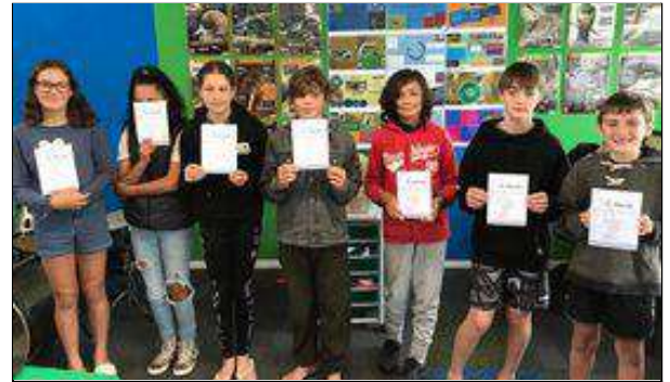
OUR BUS MONITORS - for their efforts to make our bus run as smooth as possible