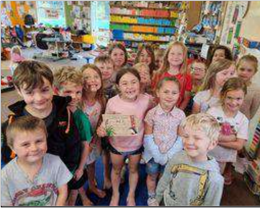
Pod 1 - Whole Class!