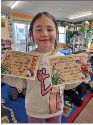
Pod 1 - Eli Skelton(Absent) & Breeana Dinning