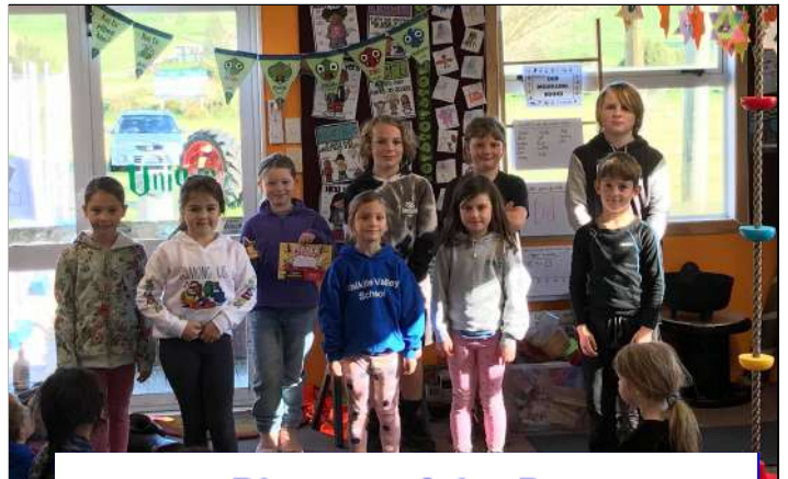
Players of the Day