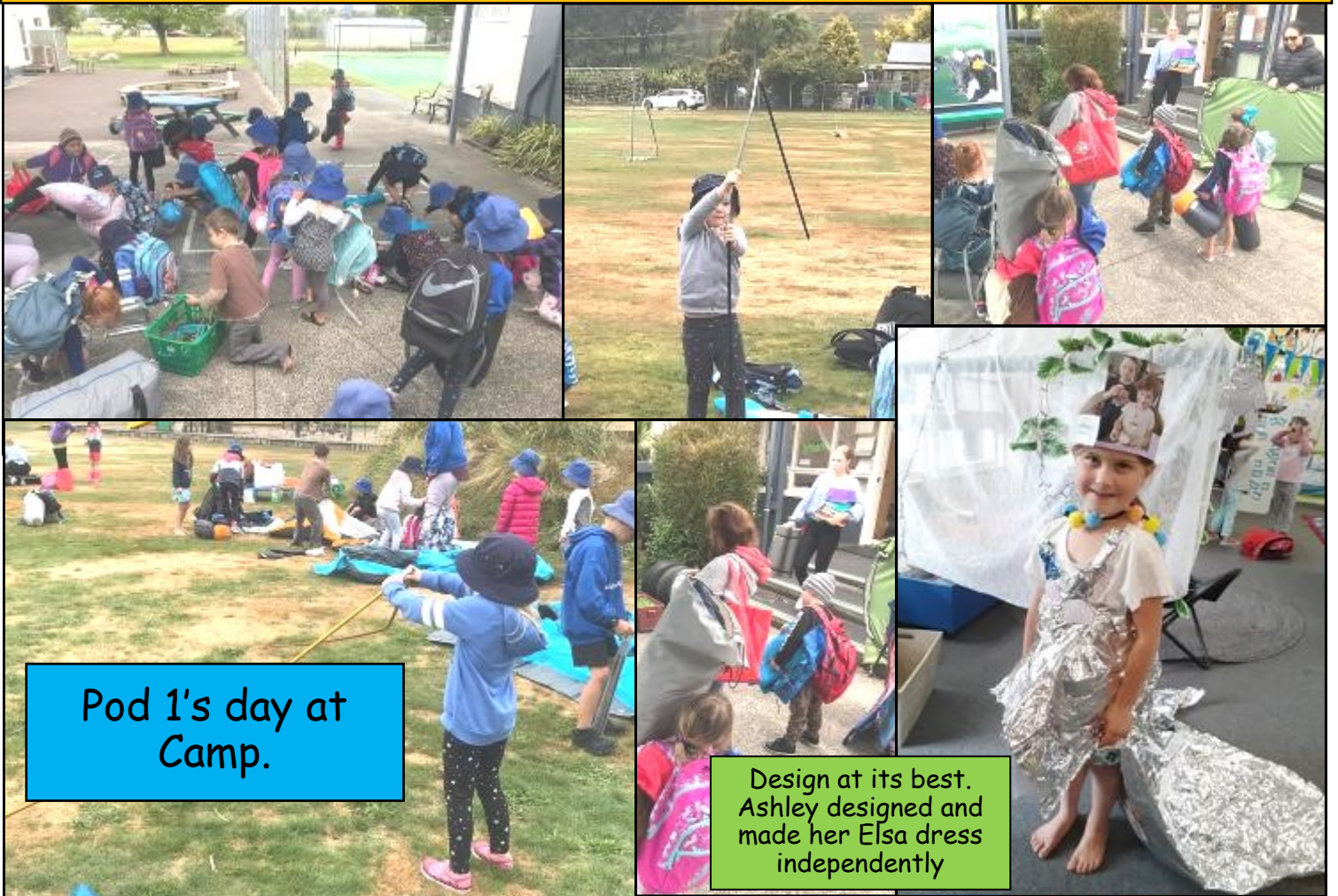
Pod 1's day at Camp.