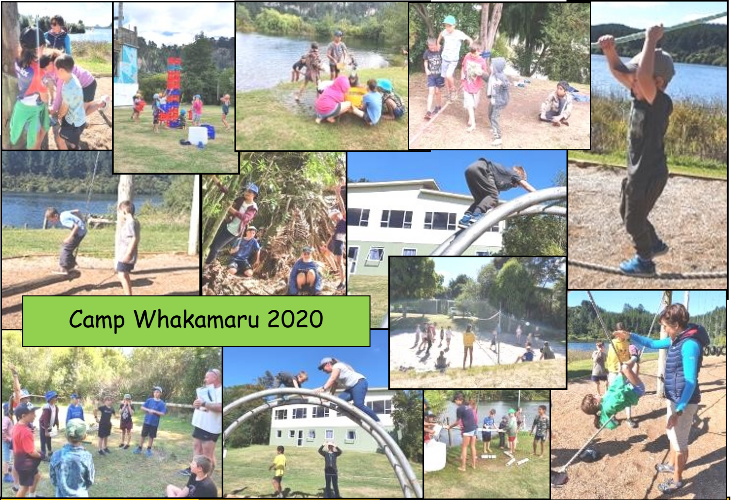
Camp Whakamaru 2020