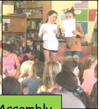
Pod 2's Sharing Assembly