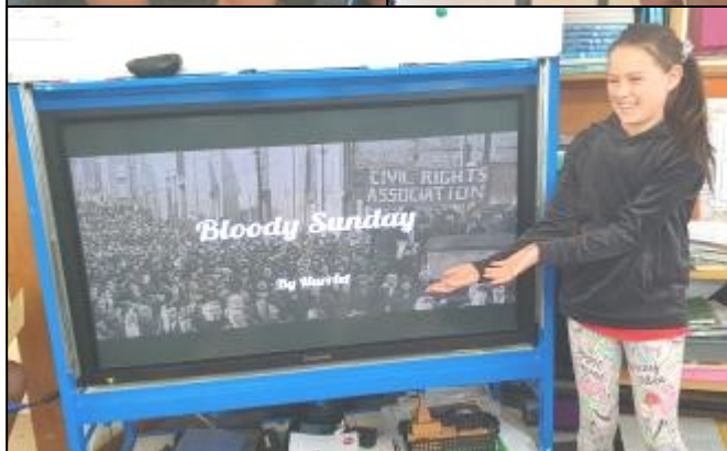
Room 4 shared their home learning and Pod 1 made toast with toppings