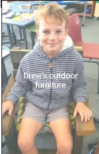
Drew's outdoor furniture