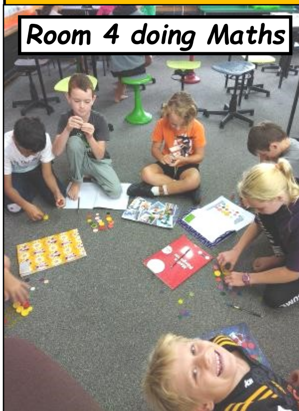
Room 4 doing Maths