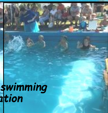
Pod 1 and 2's swimming demonstration