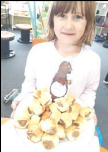
The Gruffalo has visited Pod 1. We tried knobbly knees, black tongues and roasted fox sandwiches. Yummo!