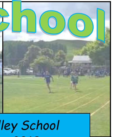
Waikite Valley School Athletics 2019