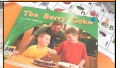
Berry cake fun for the Aliens reading group.